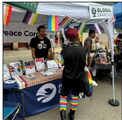
Lansing Pride 2024