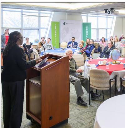
Spring Reception 2024